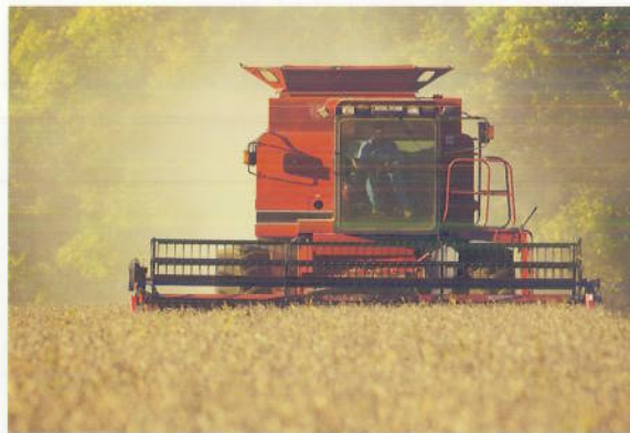
Ag Risk Managers, LLC is an Equal Opportunity provider.